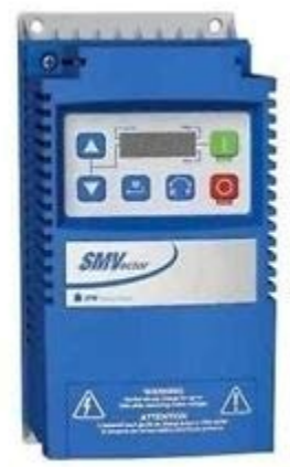
Figure 6: AC Tech VFD<sup>4</sup>

Variable Frequency Drive (VFD) controllers are a form of AC control. VFDs are able to function with both single and three phase power, depending on model. In contrast to the ECM, a VFD unit is an independent component from the motor. In a VFD controlled motor the input voltage and frequency are manipulated to create different speeds. This allows a unit to achieve many operating speeds without stopping and changing out parts. Further benefits include soft start capabilities and enhanced motor protection.